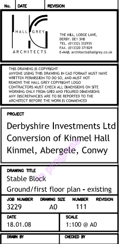
STABLE BLOCK FIRST FLOOR