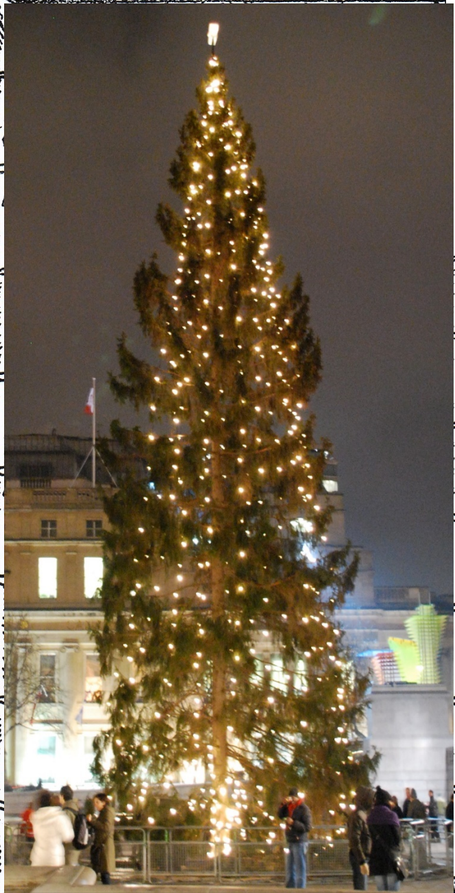
TRAFALGAR SQUARE 2020

ELEVENTH EDITION SATURDAY 11TH DECEMBER 2021